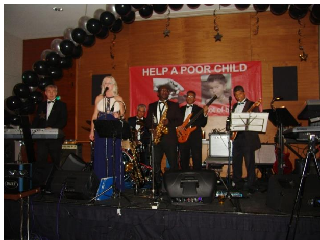
Maz & Co kept the guests entertained with their fabulous music.