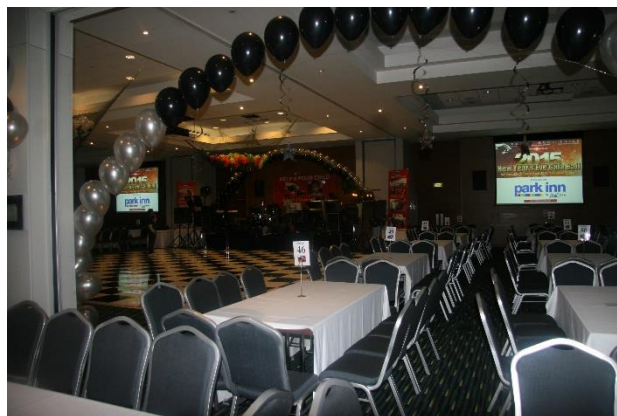
Main Hall, complete with a full-sized dance floor, all ready for guests to be escorted to their allocated seats

The Charity is extremely grateful to its many supporters, and their families and friends, who attended the annual HELP A POOR CHILD New Year's Eve Fundraising Gala Ball at the ParkInn Radisson Hotel, Heathrow.