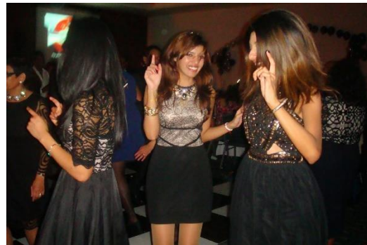
Images from the 2014 HAPC New Year Eve's Gala Ball