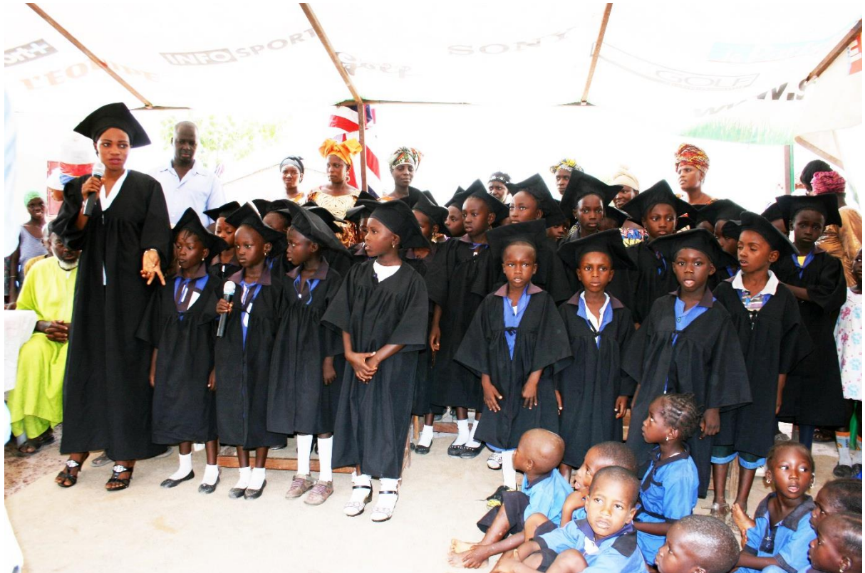
Excited children from the Colombiere School in their graduation kit, along with their proud parents, await the graduation ceremony.